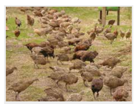
When feeding on rides spread the food thinly and only provide sufficient food so that birds can consume it quickly, leaving none for rats.