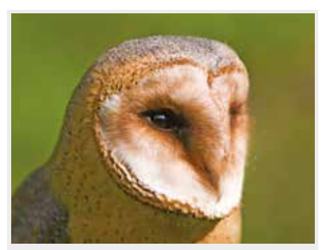
Many valuable wildlife species are contaminated with residues of anticoagulant rodenticides used in the countryside.