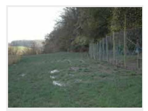
Give careful consideration to the feeding of game-birds at release sites as the food will inevitably attract rats.

Usually, the main attraction to rats provided by game management activities is an abundant source of food. Every effort must be made to restrict rat access to this resource. There are many actions that can be taken to achieve this: