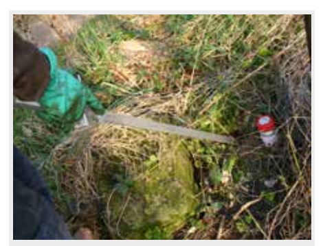
Gassing is a specialist operation and should only be done by those who are properly trained. However, it is not likely to cause harm to wildlife so long as only rat burrows are gassed.