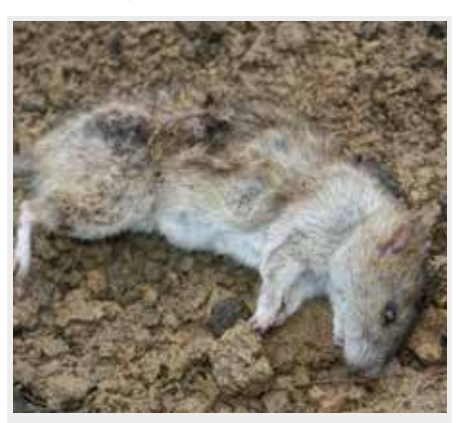
Dead rats carry residues of the rodenticides that killed them and these can be passed on to any other animals that feed on the dead rats

If rodenticides are needed, they should always be applied using the general recommendations from the Campaign for Responsible Rodenticide Use (CRRU) (http:// www.thinkwildlife.org.uk), contained in the CRRU Code of Best Practice (http://www. thinkwildlife.org/crru-downloads/crru-ukcode-of-best-practice/?wpdmdl=3220). A summary of this code is shown at the back of this booklet. This guidance is intended to reduce both primary and secondary exposure of wildlife. However, even with the use of recommended methods of application, some contamination of wildlife is likely when gamekeepers use rodenticides in the countryside and, consequently, further advice is required.