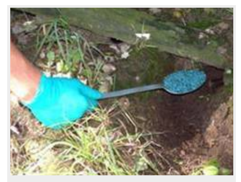
If rodenticides must be used it is often advisable to bait rat burrows. Get the bait as far into the burrow as possible using a long-handled spoon.

The application of bait directly into rodent burrows is a preferred method of application. If this is done, it makes it less likely that non-target small mammals will have access to the bait.