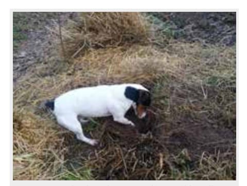
Terriers and other dogs may be used legally to take rats.

Trapping, if done well, also has a minimum impact on non-target animals and the wider environment. However, traps that are poorly set and not properly protected as they must be in tunnels can cause casualties among non-target species. Trap tunnels should be established before rats become apparent, so that they are accustomed to moving through them from the start. The traps should be set as soon as rodent signs are noticed and rats are using