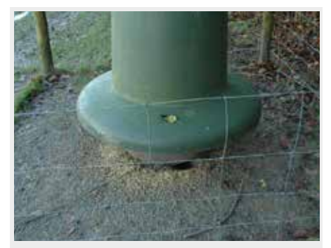
Rats will live as close to a food source as possible. Do not continue to feed birds from hoppers when rats are established near them or directly beneath them, as in this case.

are established around and even directly below hoppers. If nothing is done, large rat infestations may be present in hedgerows and coverts in spring when the birds are settling down to breed.