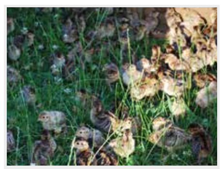
Rats are voracious predators of the eggs and chicks of game-birds

Rodents, in particular Norway rats (sometimes called common or brown rats), can cause significant problems in game management. Some of the problems are well-known and others are not so obvious.