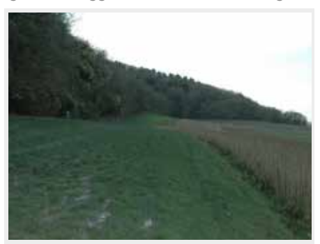
Game crops provide food and cover both for birds and for rats. It is good practice to leave a wide margin between cover and the crop so that rat runs are readily visible.

Many shoots plant game crops of various types to provide cover and sometimes food for gamebirds at certain times of year. Rats often take up residence in these, particularly if they are of high food value, such as maize. Autumn cobs and grains that were intended for gamebirds can be stripped by rats, which may then survive the winter to threaten gamebird eggs and chicks the following