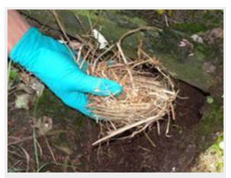
When a rat burrow has been baited it should be lightly blocked with grass, paper or straw help prevent the bait from being kicked out of the burrow. Ideally check baited burrows daily and clear up any bait that has been kicked out.