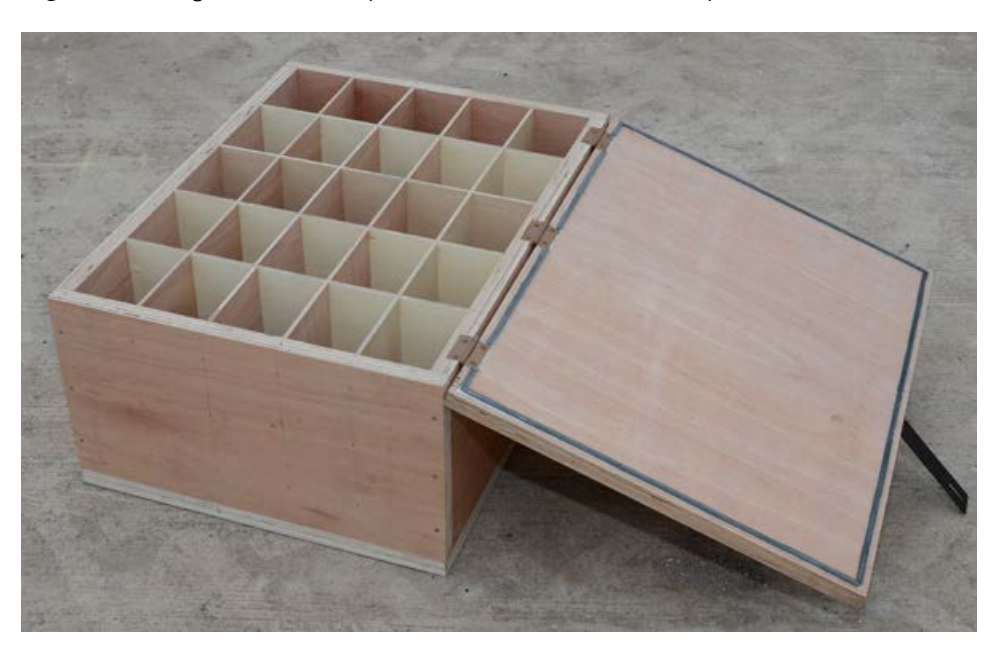
Figure 1 Storage of shooters' powder. Note intumescent strip on box lid