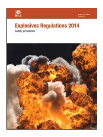
L150 Published 2014

This publication is for anyone who has duties under the safety provisions of the Explosives Regulations 2014 (ER2014) (SI 2014/1638).